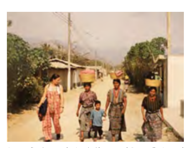
Acompañamiento a la Asociación para el Desarrollo Integral de las Víctimas de la Violencia en las Verapaces, Maya Achi (ADIVIMA), Rabinal, Baja Verapaz, 1997.

Depending on the skills and experience of the committee members, we support the following areas: finances and fundraising; personnel management; publications; training volunteers; analyzing current events; and security. Supporting the on-the-ground team is constant with weekly communication or more frequently depending on the situation.