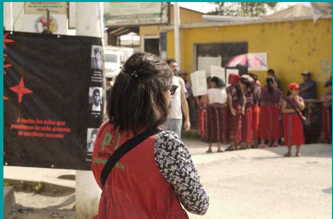
We observed the activities outside the Nebaj courthouses during the genocide case. April 2016.