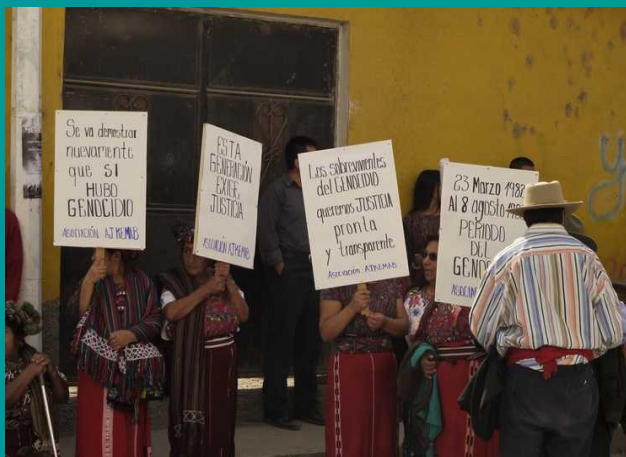
We observed the activities outside the Nebaj courthouses during the genocide case. April 2016.

In relation to the genocide case , this month we accompanied BJDHG lawyers during their journeys between their offices and the court in Guatemala City. Due to the advanced age of some witnesses, the Major Risk Tribunal moved from the capital to Nebaj, in the Department of El Quiché, so that the aforementioned witnesses could testify. This process took four days, during which we accompanied the lawyers during each of their journeys. We also observed various protests and activities outside the court which were organised by victim associations.