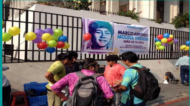
Poster outside the court houses Guatemala City on the day of the Molina Theissen hearing. April 2016.

We also attended a breakfast briefing organised by the family and the Center for Legal Action of Human Rights ( CALDH ).