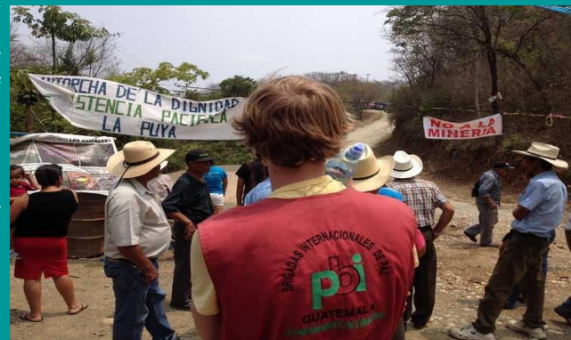
We observed the encampment whilst the Verification Commission was inside the mine site. April 2016.

During the biannual project meeting held between 4 and 8 April, it was decided to move the Association of Indigenous Women of Santa María Xalapán (AMISMAXAJ) from accompaniment to 'following'. During this new stage, we will stay in periodic contact with members and attend point in time accompaniments. We will also maintain open communication that will allow for the accompaniment to be reactivated if required.