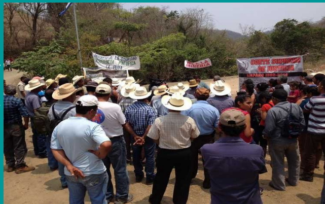
Members of the Peaceful Resistance of La Puya whilst the Verification Commission was inside the mine site. April 2016.

We also accompanied and observed the hearing of a criminal case related to one of the Resistance members.