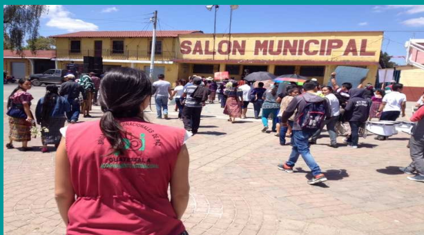
Fourth anniversary of the Community Consultation at Chinque. April 2016.

The Peaceful Resistance of La Puya. We continue to maintain a presence at the encampment at San Pedro Ayampuc. Our observation has allowed us to confirm an increased military presence in the zone due to the opening of a new military post in the same locality.